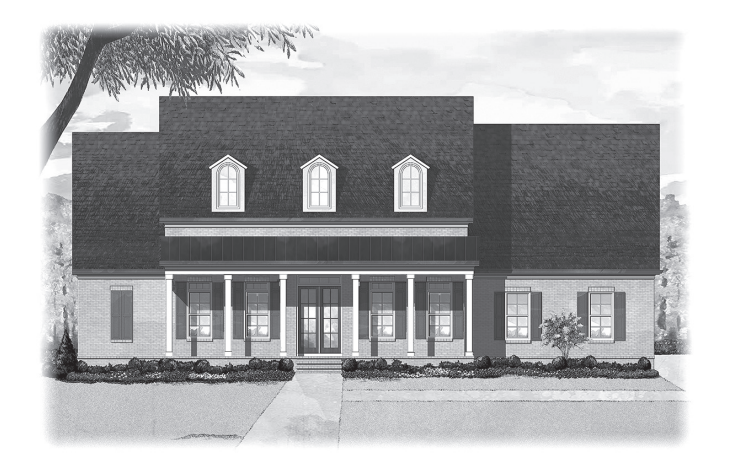
Elevation D Elevation F